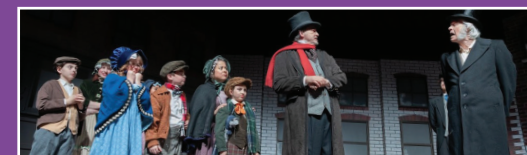
A Christmas Carol Cover: Memphis Is He Dead? Annie

Since 1934, the theatre has mounted over 500 productions and is the oldest award-winning theater in the Washington metro area, and one of the few community theaters in the country with its own building and ambitious seven-show season. Proud of its rich heritage, LTA is excited about its future.